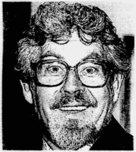
Rolf Harris Bachelor Scrambled Eggs and Tomatoes 2 eggs and 1 tomato per person; small amounts of milk, butter, salt and pepper.

Grill tomatoes with core and skin removed, add to scrambled eggs as they are starting to solidify before finally mixing them in.