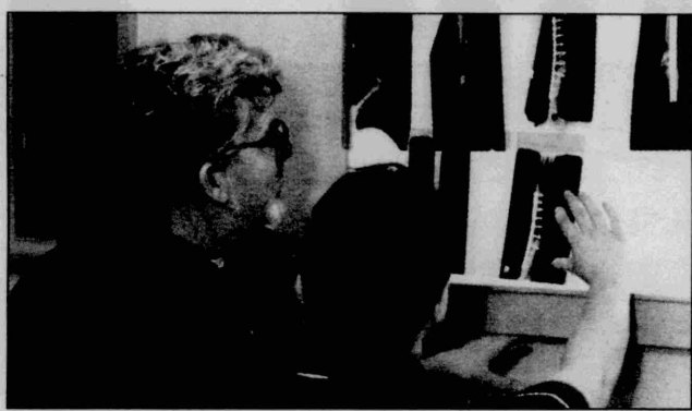
Getting the Inside Story

The recently refurbished Willows Veterinary Centre in Shirley is now one of the most up-to-date animal clinics in the country.