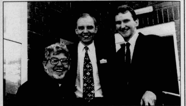
Stepping into the future of veterinary science