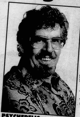
PSYCHEDELIC ... the wild Harris shirts of the 1960s