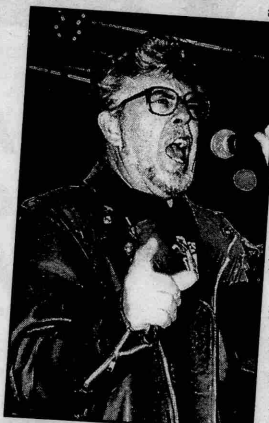
ROCK ICON ... the '90s Rolf is now into black leather ..

A USSIE star Rolf Harris has sported more amazing Technicolor dreamcoats than Joseph.